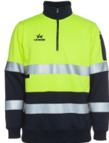
1/2 ZIP FLEECE SWEAT