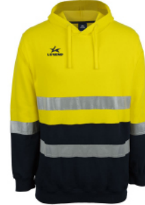
COTTON PULL OVER HOODIE