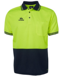
HI VIS S/S TRADITIONAL POLO