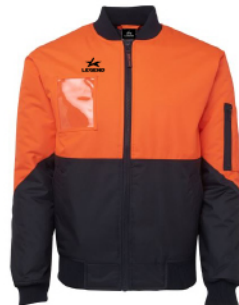
HI VIS FLYING JACKET