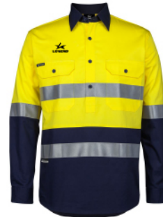
CLOSE FRONT L/S 150G W/SHIRT