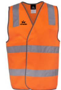
(D+N) SAFETY VEST