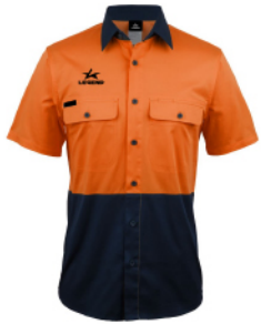
HI VIS S/S STRETCH WORK SHIRT